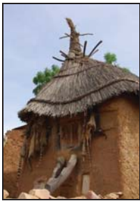
A witch doctor's hut in Dogon land, Mali

We are fighting on more than one front and must make sure that our strategies, equipment, discipline and resources are adequate