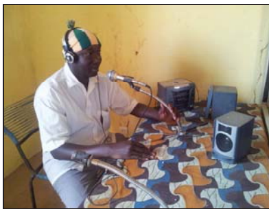
A radio anchor in a small Christian FM station in Mali